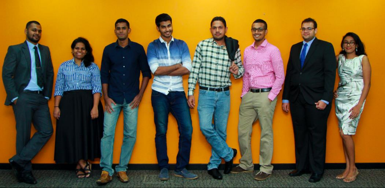
Hemas Digital Innovators