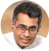
Hon. Patali Champika Ranawaka Ministry of Megapolis & Western Region Development

Hon. Ranawaka Arachchige Patali Champika Ranawaka is a Member of Parliament of Sri Lanka representing the Colombo District. He is a businessman by profession.